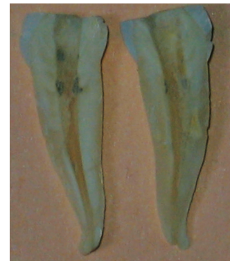
Hulsmann score: Score II.