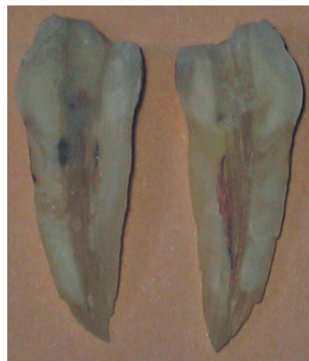
Hulsmann score: Score V.