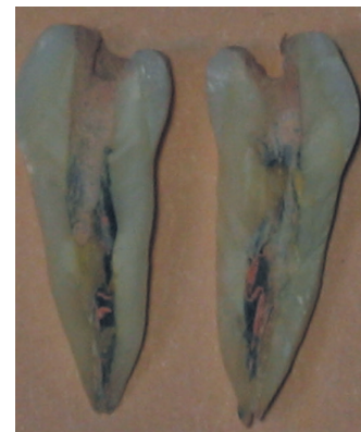
Hulsmann score: Score VI.