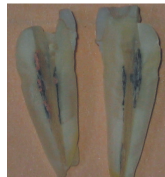
Hulsmann score: Score IV.