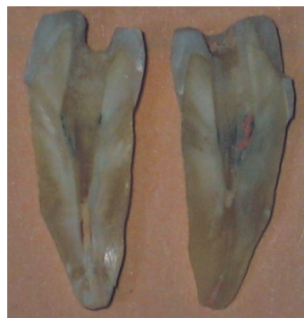
Hulsmann score: Score III.