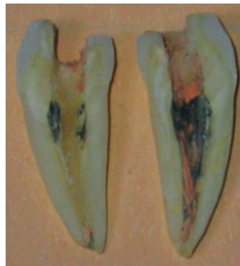
Hulsmann score: Score I

(Dentsply Maillefer, Ballaigues, Orbe, Switzerland). These files were used in a crown-down approach in combination with a torque-controlled engine (NSK, Japan) at 500 rpm, according to the manufacturer's instructions. The root canal filling material was gradually removed using light apical pressure until the pre-established working length was reached. The D1 instrument (9% taper, size 30) was first used to cre-