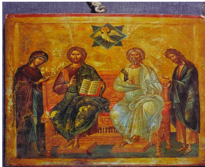
[FIGURE 8]: Trinity-Deisis Icon, St. Catherine Monastery

This unique icon shows a representation of the Deisis with the Holy Trinity including the Father, the Son, and the Holy Spirit. The Christ is enthroned as usual but, to his left, sits an old bearded man representing God (the Father) who makes the gesture of blessing with his right hand. The Holy Spirit takes the form of a dove, which releases light rays and hovers over them both. The Virgin and St. John are represented in the usual form. 49