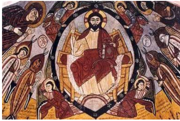
[FIGURE 1]: Deisis depiction in the Monastery of St. Antony GABRA 2002: pl. 6.4