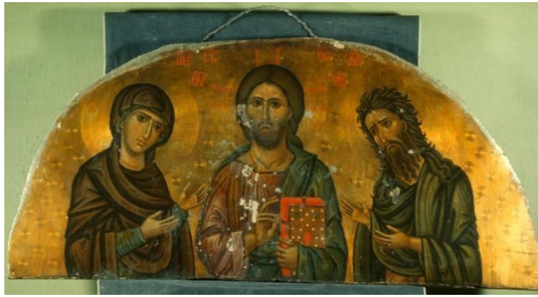
[FIGURE 6]: Deisis Figures in bust form.