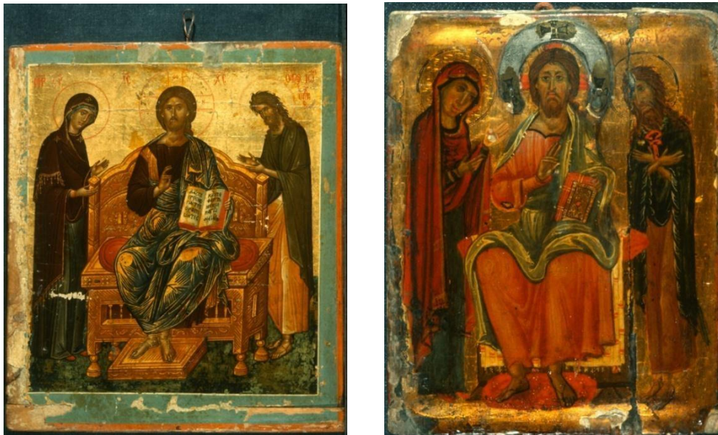
[FIGURE 4]: Deisis Icons with enthroned Christ at Sinai.

The Christ Pantocrator is depicted enthroned, his feet resting upon a footstool. He is wearing colored chiton and himation, making the gesture of blessing with the right hand while holding a closed or open Bible with the left hand. Through the open book and inscriptions in it, the Christ offers the path to salvation and presents himself as the Light of Life. 41 The closed Book is decorated with pearls. The Virgin stands to the right of the Christ turning in a three-quarter view towards him with slightly bent head, her hands extended in prayer position, and her son responds with a visual affirmation of divine benevolence or his blessing. She wears a long tunic and maphorion with tasseled fringes and red shoes. To the left of the Christ, stands John the Baptist turning also in a three-quarter view towards the Christ. He is clad in a chiton and a mantel, his hands extended or crossed in a gesture of supplication. The heads of the three figures are surrounded by nimbi , 42 with that of the Christ decorated with crosses. 43