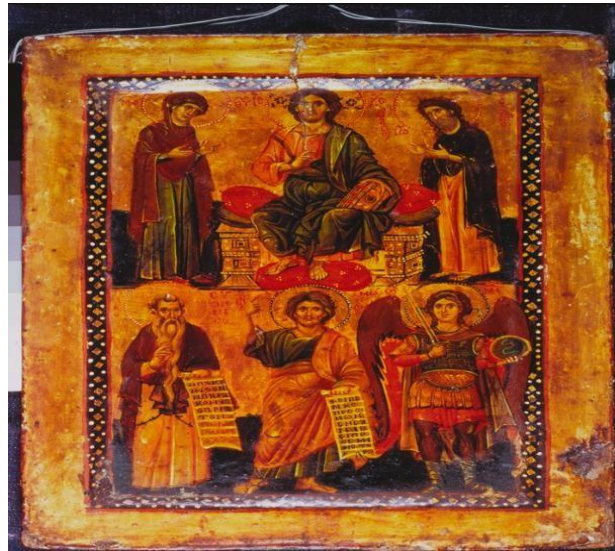
[FIGURE 7]: Deisis with St. Euthymios, Moses, and the Archangel Michael

Http://vrc.princeton.edu/sinai/items/show/6597