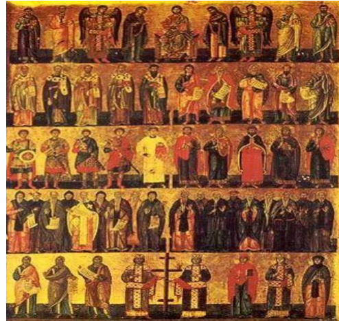
[FIGURE 9]: Right Great Deisis Icon. Left the part includes the main Deisis Figures