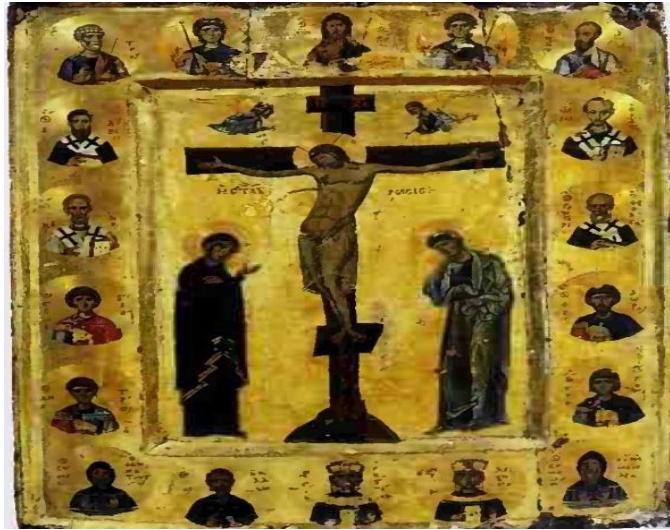
[FIGURE 10]: Deisis with Crucifixion and Saints.