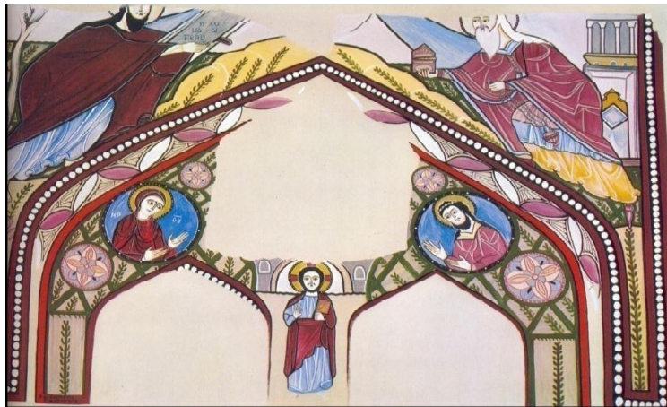
[FIGURE 2]: Deisis mural in the Monastery of St. Macarius at Wadi Natrun

On the Eastern wall of the Sanctuary of St. Mark, Monastery of Saint Macarius, a twelfth century illustration of the Christ Pantocrator stands holding the Holy Bible and raising the right hand in blessing. To his right is represented the Virgin Mary inside a medallion, and Saint John the Baptist is depicted in a medallion to his left. Above the arch, priest Aaron is represented to the right holding in his right hand the incense box, and swinging a censer with his left hand, and Moses is depicted to the left, wearing a red cloak and stretching his arms to take the incense box. 38