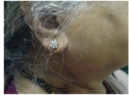
Fig. 2: Bilateral parotid gland enlargement.

to increase the water intake for symptomatic relief of xerostomia, oral burning sensation and dysphagia.