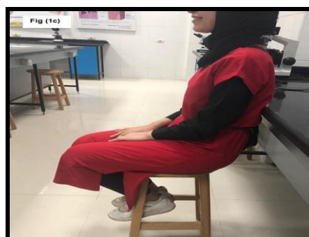
Figures (1a, 1b &1c): Types of educational furniture in the Faculty of Physical Therapy at Delta University for Science and Technology.