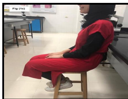
Figures (1a, 1b &1c): Types of educational furniture in the Faculty of Physical Therapy at Delta University for Science and Technology.