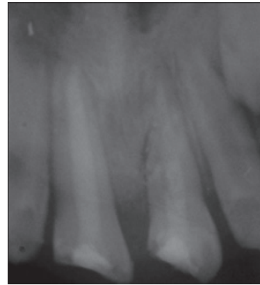
Fig. 3: Periapical radiograph showing the apices formation.

rier formation. The time interval for calcium hydroxide apexification has been reported to be variable, ranging from 3-24 months [10]. Some studies showed that when the frequency of changes was low, rapid barrier formation was seen whereas when the frequency of the changes was high, it needed more time for barrier to be formed [27, 28]. Also it is confirmed that, if the apical barrier is disturbed by repeated instrumentation and dressing changes, the time needed for apex formation will be prolonged [29].