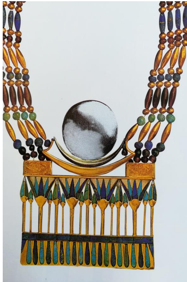
[FIGURE 2]: The center part of Tutankhamun's necklace, jd'E 61897, The Grand Egyptian Museum, JAMES 2000: 211