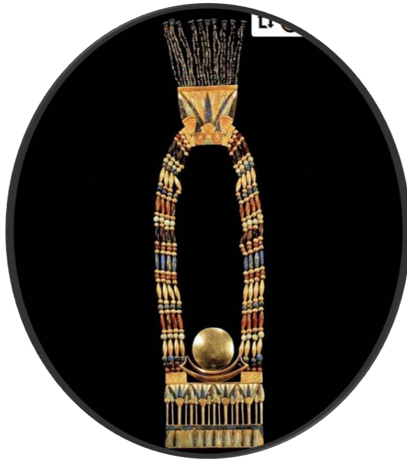
[FIGURE 1]: Tutankhamun's necklace jd'E 61897, The Grand Egyptian Museum.