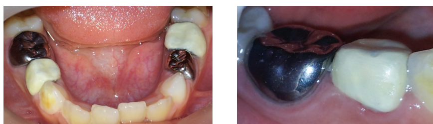
Fig. 2: The clinical marginal adaptation of both conventional and esthetic crowns.

Proximal contact areas between the first and second primary molars were recorded as either intact or open, by passing a dental floss.