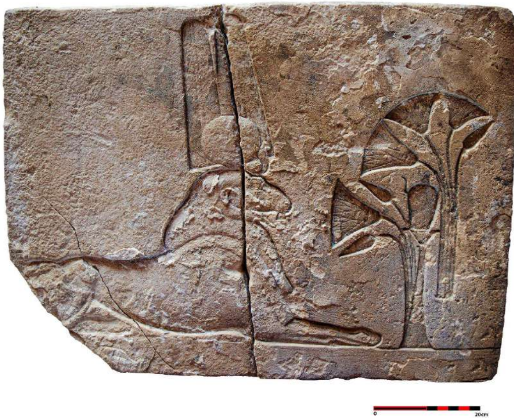
[FIGURE 1]: Amun-Ra stela