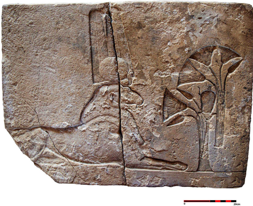
[FIGURE 1]: Amun-Ra stela