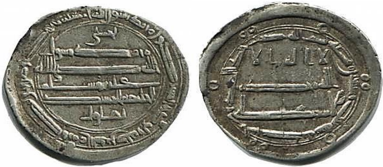
[FIGURE 1]: Abbasid dirham of Hārūn al-Rašīd, minted in al-MuḤammadiya in 173 AH, W. (2, 82G), D. (24 mm) 18