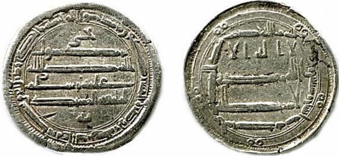
[FIGURE 2]: Abbasid dirham of Hārūn al-Rašīd, minted in al-Muḥammadiya in 172 AH, W. (3,1G), D. (24,5 mm) 68