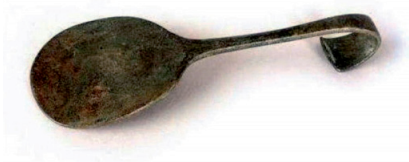
Fig. 1: A copper spoon used as a medical implement to press down the tongue.