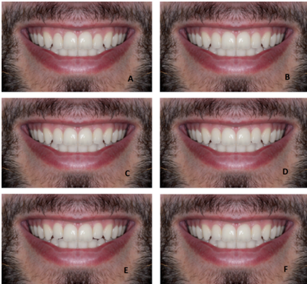
Fig. 2: Man smile. A: 0 mm step between the upper lateral incisors and the upper central incisors (central incisors being fixed); B: 0.5 mm step; C: 1.0 mm step; D: 1.5 mm step; E: 2.0 mm step; F: repeated picture for the 1.0 mm step.

As for the comparison between the results of women and men (all groups combined) not statistically significant difference was detected.