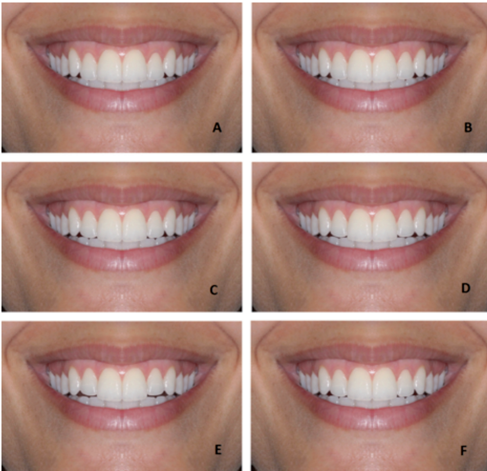
Fig. 1: Woman smile. A: 0 mm step between the upper lateral incisors and the upper central incisors (central incisors being fixed); B: 0.5 mm step; C: 1.0 mm step; D: 1.5 mm step; E: 2.0 mm step; F: repeated picture for the 1.0 mm step.

most attractive. The evaluators were not informed of the modified criterion in each picture.