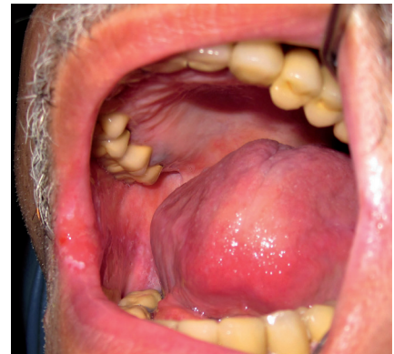
Fig. 4: Muco-cutaneous lichenous lesions.