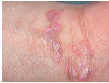
Fig. 1: Wickham striae that course the surface of a papule of lichen planus.

The exact etiology of the OLP remains unidentified. Although various antigens have been considered, what triggers the inflammatory response of T lymphocytes is unknown. Suggested predisposing factors include genetic factors, stress, trauma and infections. Smoking and alcoholism (heat and irritation of the mucous membranes by vapors, class of Betel [4, 6]) could promote the development of lichenous lesions.