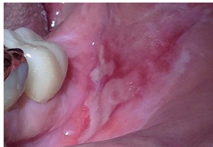
Fig. 5: Erosive LPO.

Various associations between the OLP and certain systemic pathologies are described in the literature. Most are controversial, due to lack of documentation or to geographical disparities [8, 9]. These include Grinspan syndrome, liver disease and graft-versus-host disease [10].