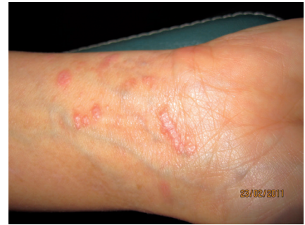
Fig. 2: Lichen planus lesions on the forearm.