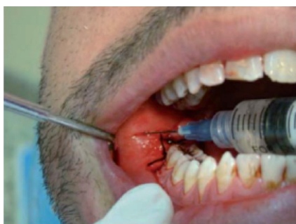
Fig. 3: Submucosal injection of dexamethasone.

study results concerning the effectiveness of this route to administer dexamethasone after wisdom tooth surgery [7, 13-15].