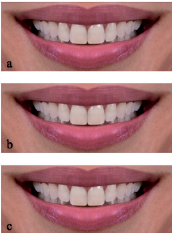
Fig. 2: Discrepancies between centrals and laterals of 0.5 mm (a), 1 mm (b) and 1.5 mm 2 (c).

on personal information (age, sex, profession and specialty). The second part includes the photos of the modified smiles. Under each photo is displayed a visual analog scale (VAS) delimited from the least attractive on the left to the most attractive on the right.