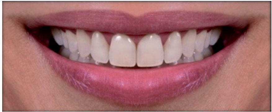
Fig. 1: Reference smile.

The shape, position and color of the teeth as well as the gum tissue and lips determine the harmony of a smile. However, smiling is also a complex dynamic expression involving several aspects of the face [9]. The lips are considered to be the "frame" of the smile. In fact, a multitude of facial muscles work together during the smile and animate the lips to reveal