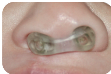
Fig. 9: Placement of the nasal conformer