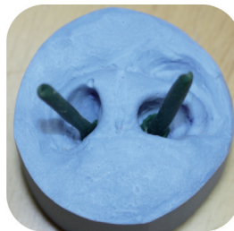
Fig. 6: stems for the nasal orifice