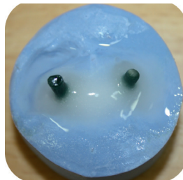
Fig. 7: the transparent resin in place