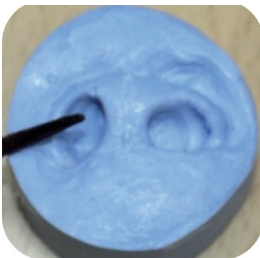
Fig. 5: Model from the nasal orifice impression