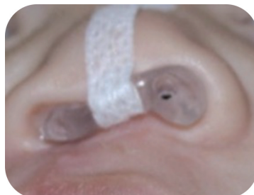
Fig. 10: Using medical tape to hold the nasal conformer in place

This vision is also adopted by the team of Titiz et al [6] who insist on their role in restoring ventilation, aesthetics by correcting the collapse of the nose nasal wing without forgetting their important orthopedic role in the growth of the maxilla from the first operation