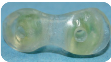
Fig. 8: Aspect of the conformer after the polymerization of the resin