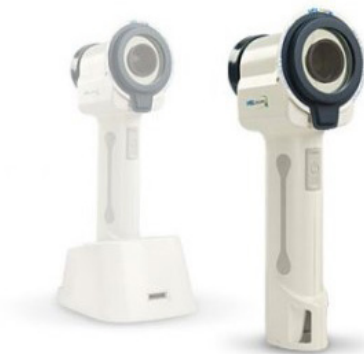
Fig. 2. Velscope

A hand-held device based on autofluorescence is employed as a potential adjunct diagnostic aid for patient populations at high risk for oral cancer [7]. The main advantage is that it is a non-invasive alternative to biopsy [7]. Vibute NA et al. showed a specificity of 44.4 percent when Velscope was used in screening thirty oral cancer patients [7].