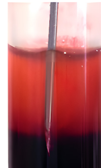
Figure 1: one mL taken from the upper liquid red and yellow layer with the buffy coat

needle tip after the procedure, a saline-soaked sponge was placed between the lip and the gingiva and removed after 15 minutes. A total of four sessions of i-PRF were administered to patients at a ten-day interval. On the other hand, after PMRP, hyaluronic acid (GENGIGEL®) was applied in the following forms (one ml of 0.8% HA was injected subgingivally once every four weeks), topically (0.2 ml of 0.8% HA was applied by the patient twice daily for the following 14 days after the subgingival application) (Figure 3).