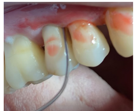
Figure 2 : The red i-PRF injected into the pocket at the point of interdental space. Note that the red color on teeth is the topical anesthesia gel.