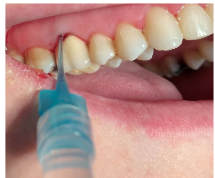
Figure 3: subgingival injection of 0.8% HA.