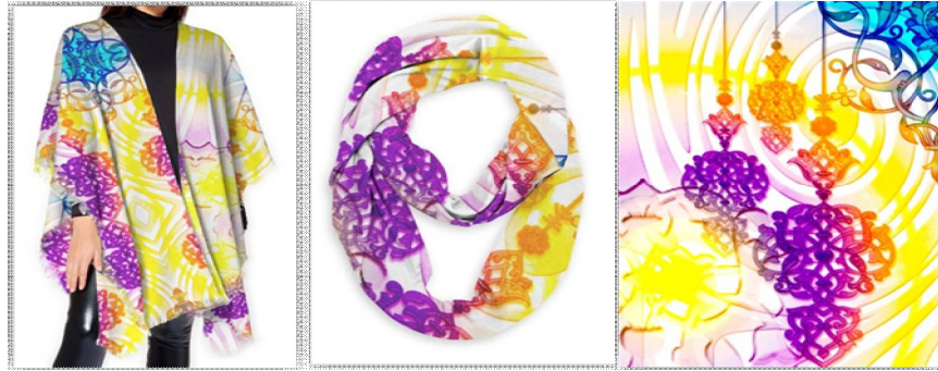
Spring Design (1) & the implementation in the fashion design

geometric shapes dominate we the texture of oil colours, both designs present the light and crisp clear warm colours.