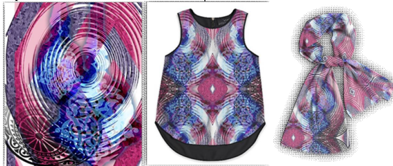
Summer Design (1) & the implementation in the fashion design

while in the second design the overlapping in colours and shapes is so clear and we can feel the semi-transparency in shapes and colours, the soft neutrals control the design.