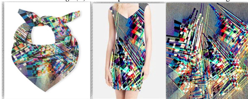
Summer Design (2) & the implementation in the fashion design