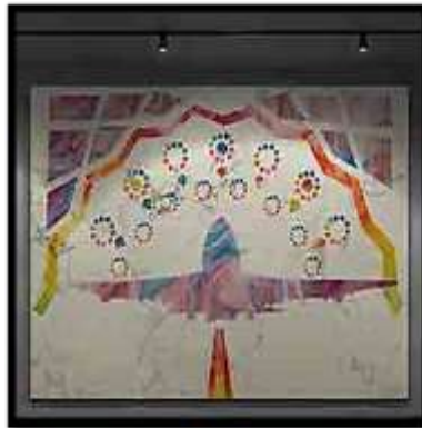
Inspired from: Abdunnasser Ghrem Painting