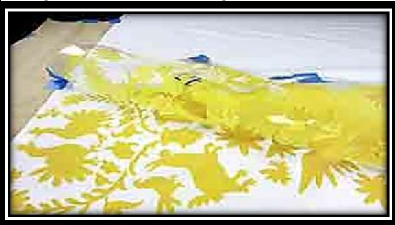
Fig (2): Stencil Technique

B-Tie-dyeing: Method of dyeing by hand in which colored patterns are produced in the fabric by gathering together many small portions of material and tying them tightly with string before immersing the cloth in the dyebath. The dye fails to penetrate the tied sections, after drying, the fabric is untied to reveal irregular circles, dots, and stripes. Various colored patterns may be produced by repeated tying and dipping in additional colors. This hand method, common in India and Indonesia, has been adapted to machines. It can be