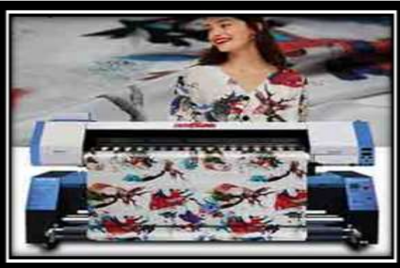
Fig (8): Digital Printing on Fabric