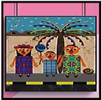
Inspired from: Abdulaziz Al-Najem Painting