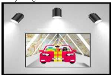
Inspired from: Taghreed Albakshy Painting