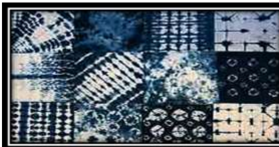
Fig (3): Tie and Dye Technique

considered as a kind of resist printing. This technique has some benefits, such as solvent recycling, which eliminates the effluent control problem, rapid dyeing with minimal energy requirements, improved levelness and dye yield compared to better fabric aesthetics, and low cost, while some of its disadvantages as, such as solvents are costly, resulting in higher manufacturing costs, equipment availability issues, and the inability to reuse existing dye.