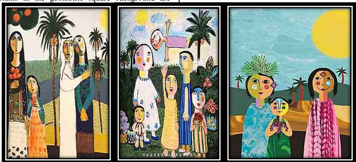
Artist (Taghried Albakshy) Paintings Design Idea No. (8)