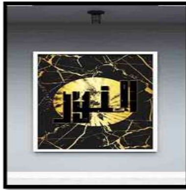
Inspired from: Luluwah Alhamoud Painting