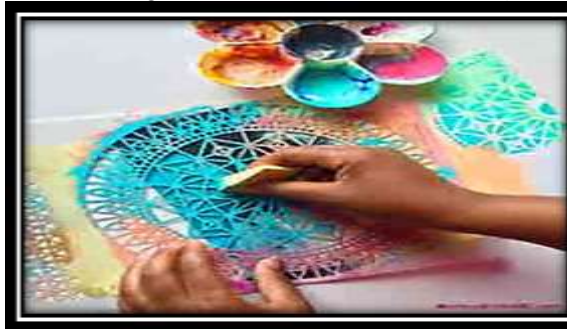
Fig (1): Stencil Technique

that good design is difficult to obtain, It is labor intensive and time consuming to print, and it is best suited for single-use applications rather than large-scale manufacturing.