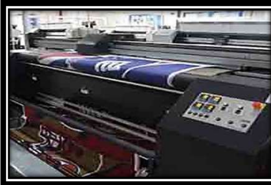
Fig (7): Digital Printing on Fabric

5- Digital fabric printing technique: Great advancements in the field of textile printing have recently been made in the areas of head technology and ink production. This method is similar to computer-controlled paper printers used in offices, but on a much larger scale with many variables to handle in order to achieve the best possible fabric result. Files and color control, printer and RIP technology, fabric pre and post treatment methods, inks/dyes, and client standards are some of the variables that must be coordinated for effective digital fabric printing. Fabric printing is performed directly on the fabric with digital inks, as if it were paper, via the computer. In 1999 The Jenkins Company came up with a new product called "Bubble Jet Set" that are suitable for silk or cotton fabrics. A piece of cloth, precut to a size appropriate for the printer, is soaked in the liquid and hung to drip dry. The handled fabric is ironed and then ironed to a backing of freezer paper to help stiffen it so it can run through the printer.