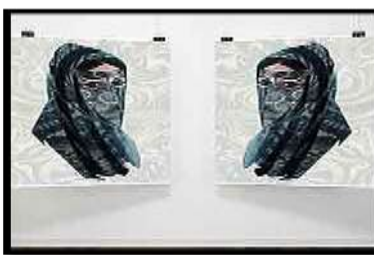
Inspired from: Dia Aziz Painting