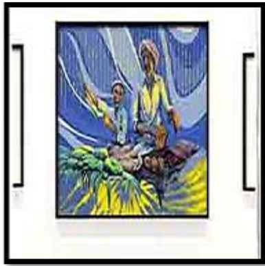
Inspired from: Dia Aziz painting