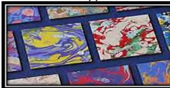
Fig (5): Marbling Technique

covers and end papers, but its history and application go far beyond that. Today, it's used to create artwork, fine papers, and fabric designs. From its advantages that no two finished pieces are exactly alike, while the disadvantages it is a very expressive art, each print is the culmination of a tiny performance in which the artist interacts with a fluid medium, revealing their temperament.