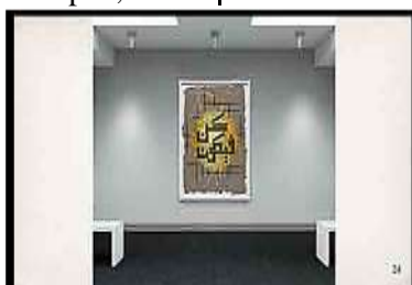
Inspired from: Luluwah Alhamoud Painting