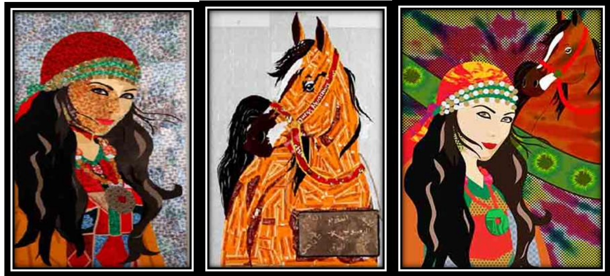
Artist's (Ghada Alrabea) Painting Design Idea No. (4)