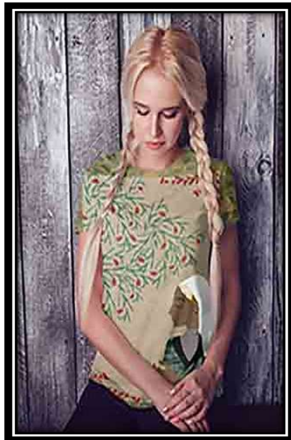
Employment Proposal for Women's Clothing

Technical analysis of the design idea: Design depends on using various groups of plant in geometric elements while the lady in tie and dye appears in the downright part of the design, the design relies on using different groups of plants in geometric elements and distributing them with varied repetition in the region of the design. The plants in the geometric square background are