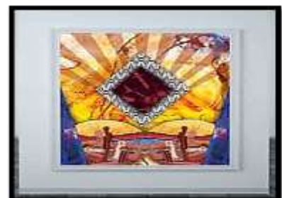
Inspired from: Munira Mosly Painting