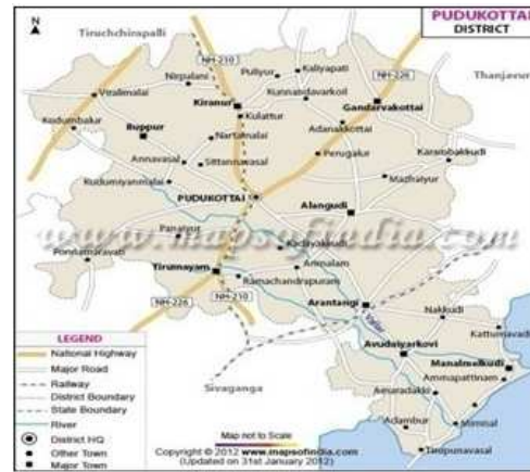
Fig. 1: Pudukkottai district map.

Multivariate statistical analysis, such as Factor analysis (FA)/Principal component analysis (PCA), Cluster analysis (CA) Canonical correspondence analysis (CCA),