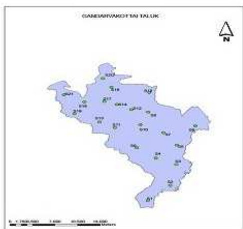
Fig. 2: Sample location from study area.

in the south western parts of the district, depressions and slopes found in the terrain are useful to construct tanks for irrigation purpose.